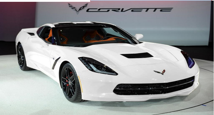
1967 to 2017