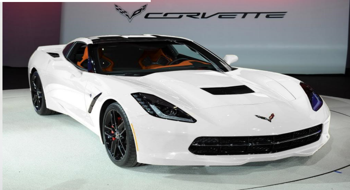
1967 to 2017